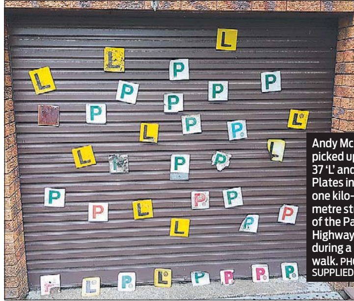
Andy McQuie picked up 37 'L' and 'P' Plates in a one kilometre stretch of the Pacific Highway during a walk.

john.ryan@panscott.com.au or 0429 452 245 txt is best